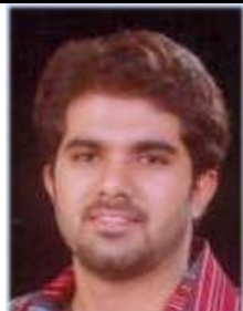
Abdul Rahman Chair