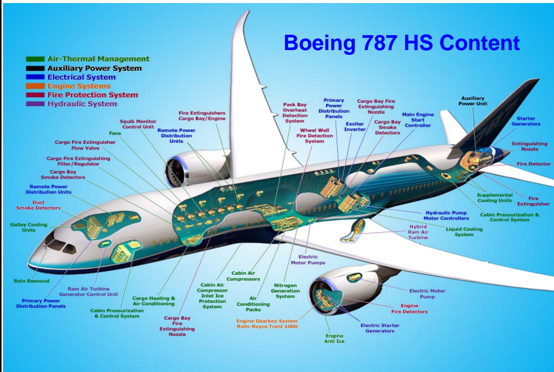
< Hamilton Sundstrand content on the 787 Dreamliner

Kudos to the Hamilton Sundstrand team (many of which are on the RRVS Executive Committee) for the outstanding presentations and tour that were provided on September 27th. Highlight images: