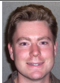
McClean Wendt Chair